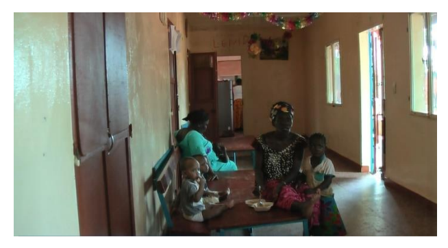
Dinner in the orphanage le Nid

The children receive food enriched with baobab powder and peanuts. Again, one of the central problems is the high cost of electricity for lighting and pumps, along with the frequent brownouts of the electrical power grid.