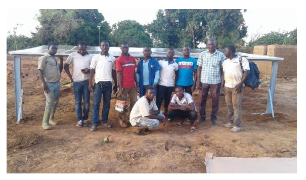
The installation of the pump is completed

In April , the team of Solafrique installed a Lorentz PS1800 surface pump, solar panels with a total installed power of 3000 W and two streetlamps with automatic control in the village of Djigui in the commune of Douna . The project was directed by Swiss NGO Helvetas , as part of a larger project for supplying water for the pisciculture basin of a training center.