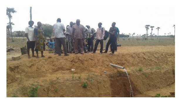
The pisciculture basin gets its first water

In May the trainees of Solafrique were taught about the manufacturing and use of solar ovens and solar dryers.