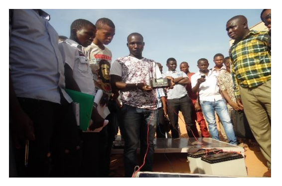
Learning about photovoltaics

January 2018: In January 2018, Solafrique organized a comprehensive course for graduating students at the University «Aube Nouvelle» in Bobo Dioulasso. The course covers the theoretical basics of photovoltaics and was complemented by exercises and practical work. Ten students visited the course; they can now contribute to the promotion of renewable energy in their country.