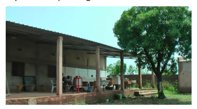
Training session for future beekeepers

beekeepers. In March through July mangoes also have to be dried, which requires a lot of water and electrical power. Mr. Zongo is keen to acquire a solar pump (this also requires a test drilling) and also contemplates switching to solar power for lighting and for the five dryers he is operating.