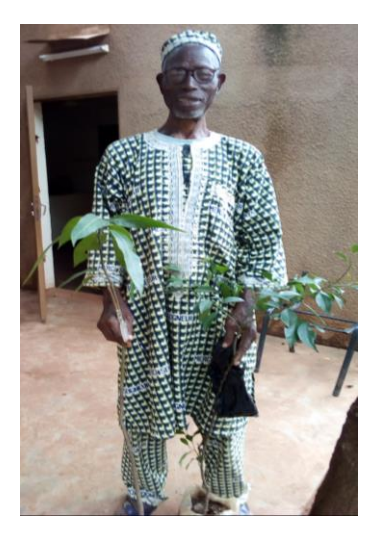
A neighbor with a mango tree seedling